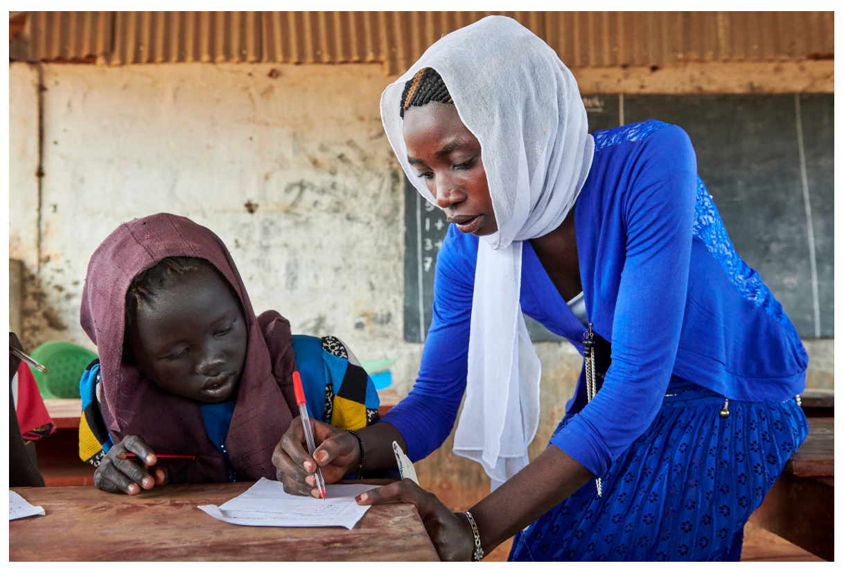
World Refugee Day June 20, 2020